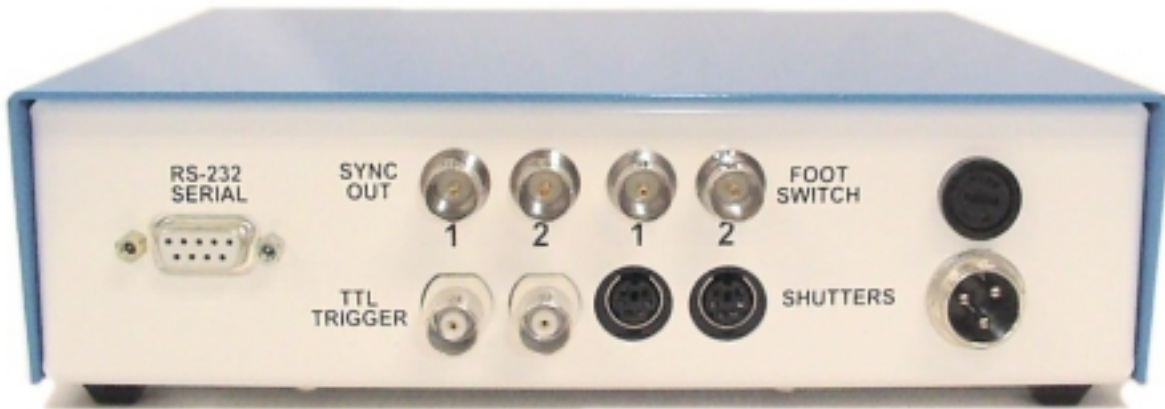
Figure 2: Back Panel Connections