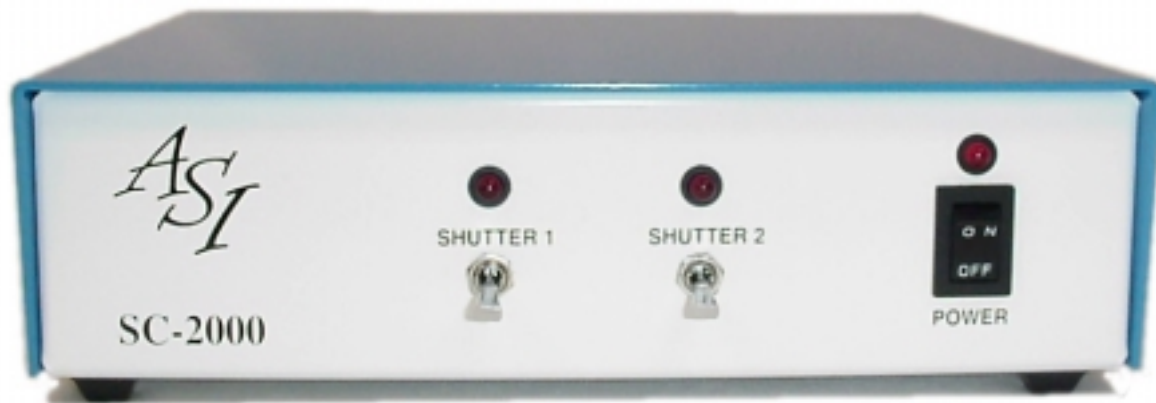
Figure 1: Front Panel Controls and Indicators

The switches on the front panel of the SC-2000 controller allow the user to directly activate the shutters. In the Up position, the shutter is energized (activated). In the Down position, control returns to the serial command, foot switch, or TTL Trigger inputs.