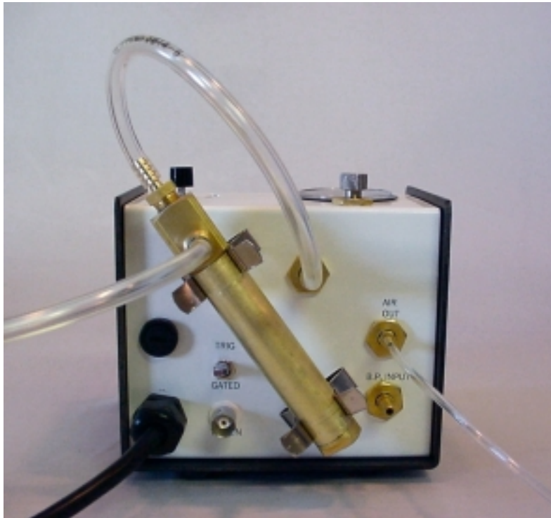
REAR VIEW OF MPPI-2