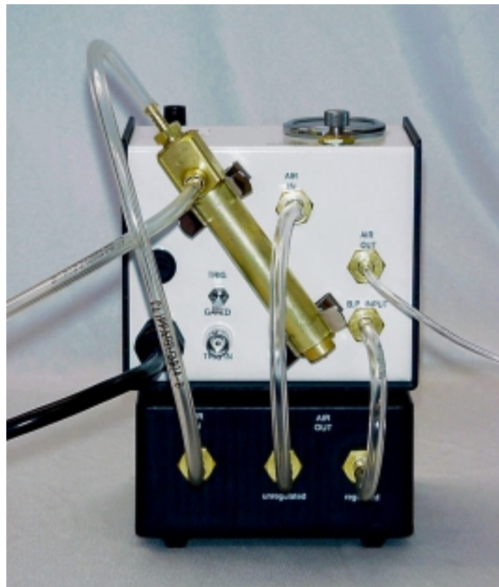
REAR VIEW OF MPPI-2 CONNECTED TO BACK PRESSURE UNIT (BPU)