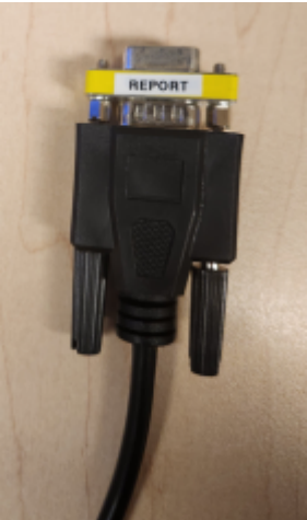
Straight through serial cable with gender changer

contact ASI to get a cable to split the connection between CRISP and the serial port.