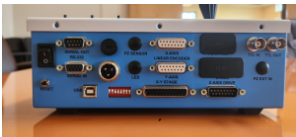
A standard MS-2000 with RS-232 SERIAL OUT

To use the optional SERIAL_OUT module, the controller requires the RS-232 SERIAL OUT port on the back of the MS-2000, this feature uses the second serial port to output the report.