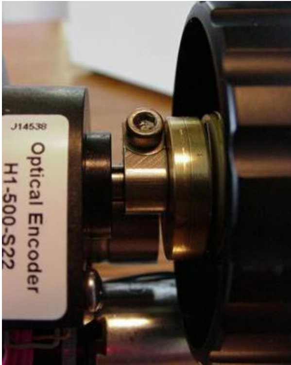
Figure 3. Brass Clutch plate