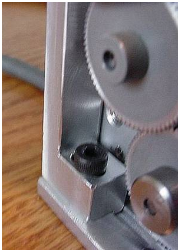
Figure 2a. Adjustment bars, Horizontal Adj Screw