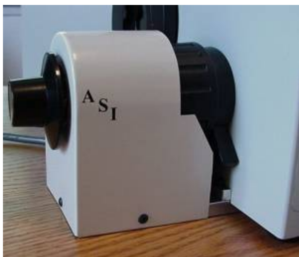
Figure 1. ASI drive Installed

Note: The Clamp Must Be Securely Tightened Or The Drive And Clutch May Slip.