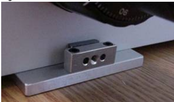
Figure 4. Base plate clamp assembly

6.) Slide the motor drive up and down, forward and backward slightly while turning the right fine focus knob until it is in the position where minimum drag is felt on the right focus knob. Secure the motor drive into position by tightening the horizontal and vertical adjustment screws.