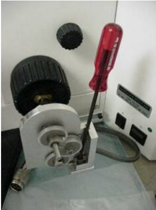
Figure 6 leica, zdrive, DMRB